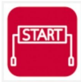
Using Canvas for the 1st Time

Option 1: Remember to check out the Canvas Support for faculty and students from the OAT website.