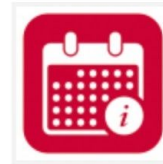
OAT Canvas Workshops